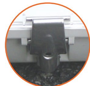
Stainless Steel Fastener (Optional)