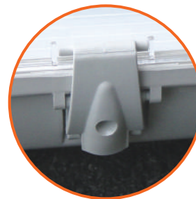
Standard Plastic Fastener