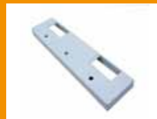
Twin Lampholder Bracket