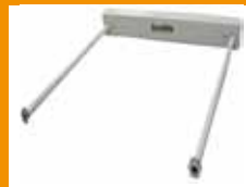
Suspension Rods for 2ft/4ft