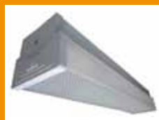
DC - Diffused