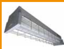
DC - WireGuard