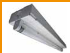
DC - Single