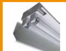
Metal Reflector H