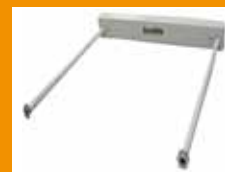
Suspension Rods for 2ft/4ft