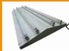
4 Lamp Option - Available on request