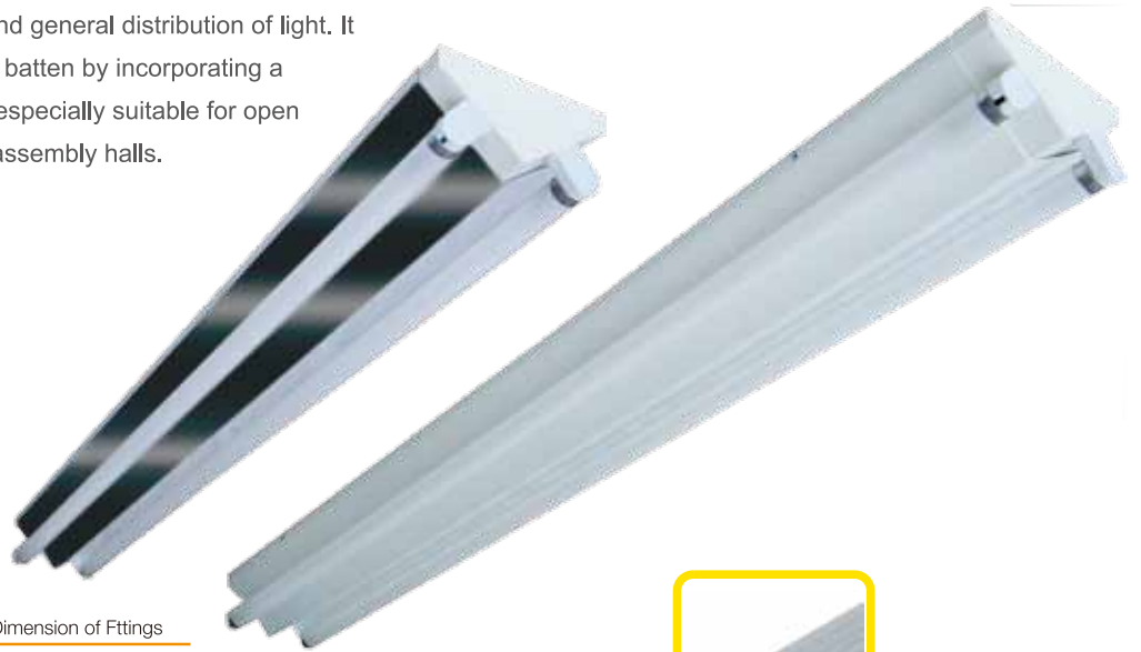
Dimension of Fittings