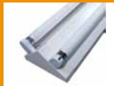
Epoxy – High Reflectance