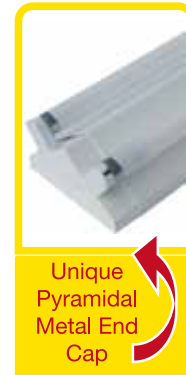
Unique Pyramidal Metal End Cap