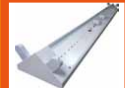
Fully Welded – High Rigidity