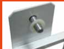
Anti Loss Washer