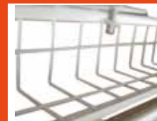
Fully Welded Frame