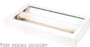
White epoxy powder coated reflectors