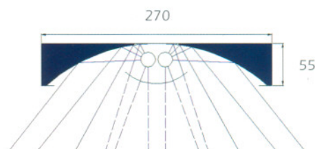
FRONT VIEW Height 55mm x 270mm x 465mm